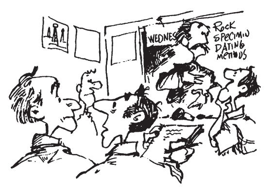
"What do we do about possible past contamination that could easily produce great errors in rock specimen dating?" "Oh, we don't worry about that. We must assume that contamination did not happen."