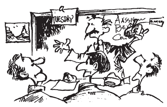
"How do we date rocks? It's easy. First, we assign various assumptions to each dating method to bring them into alignment with strata dating. Then we examine each individual rock, and apply or leave out a variety of special assumptions to it. The research conclusions really look good in print."