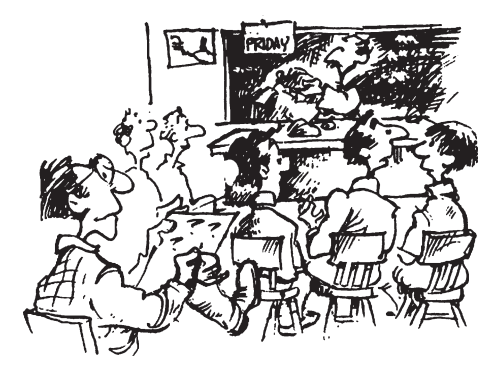
"Anomalies, you ask; what do we do with anomalies? Those are the rock and fossil samples which we can't jam into line with the dating theory. Well, they require a special technique: Stick them into a back drawer and forget them."