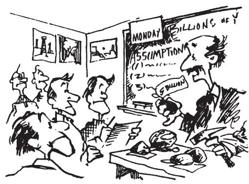
"By using dozens of assumptions, we're able to to assign billions of years to rocks. We do this to prove that life forms gradually evolved from nothing."