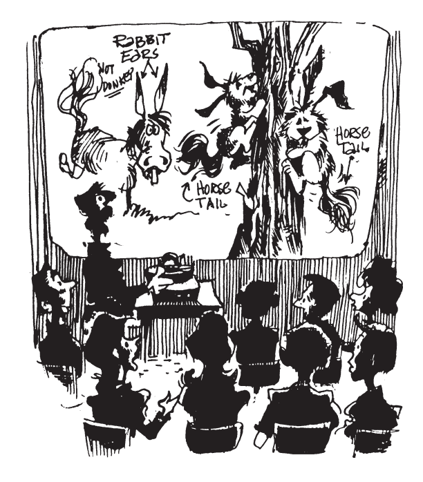
"This little rabbit is the ancestor of the horse. Although it climbed trees and did not look like a horse, it had a tail. This helped us identify it as the Dawn Horse ."