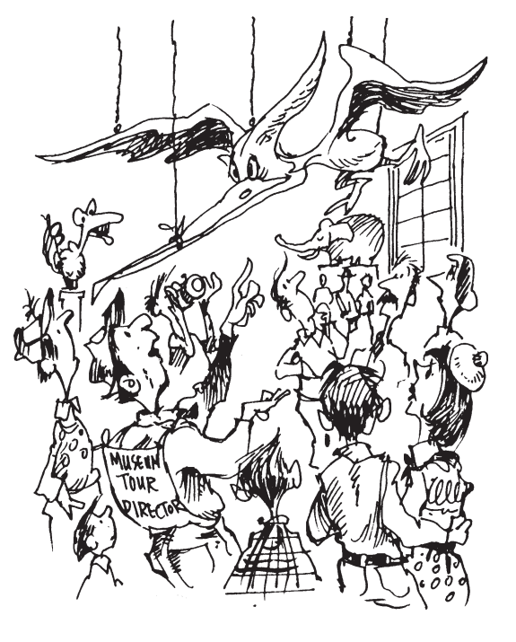
"Scientists have come to two alternate conclusions, regarding Archaeopteryx . First, it is just a bird. Seocnd, it is just a fake."