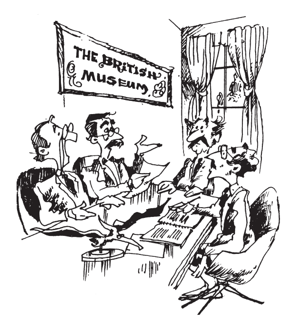
"The best way to answer this charge is to withdraw Archaeopteryx from public display, and let no more scientists examine it."